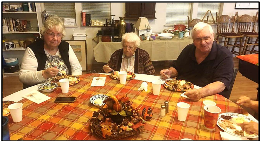
Friends visiting at the turkey dinner.