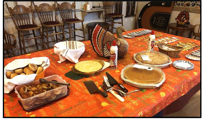
Friends visiting at the turkey dinner, and the dessert table was fabulous!