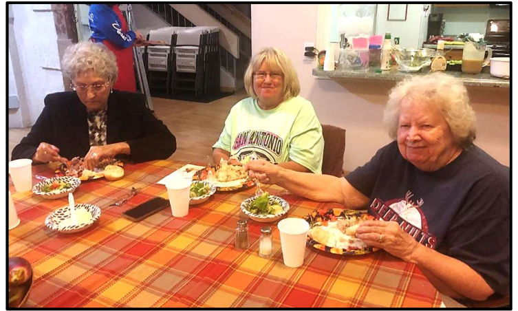
Friends visiting at the turkey dinner.