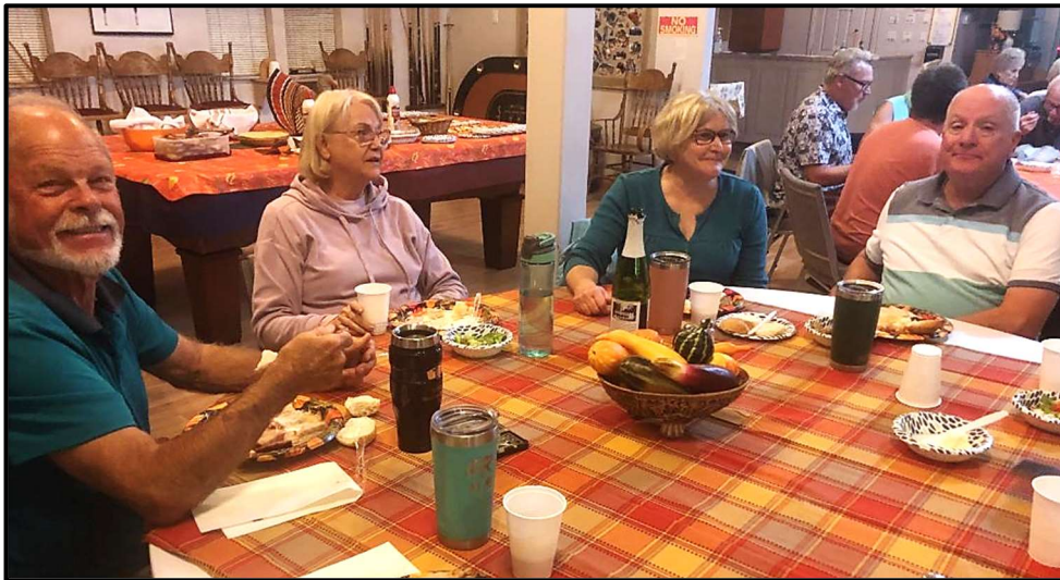
Friends visiting at the turkey dinner.